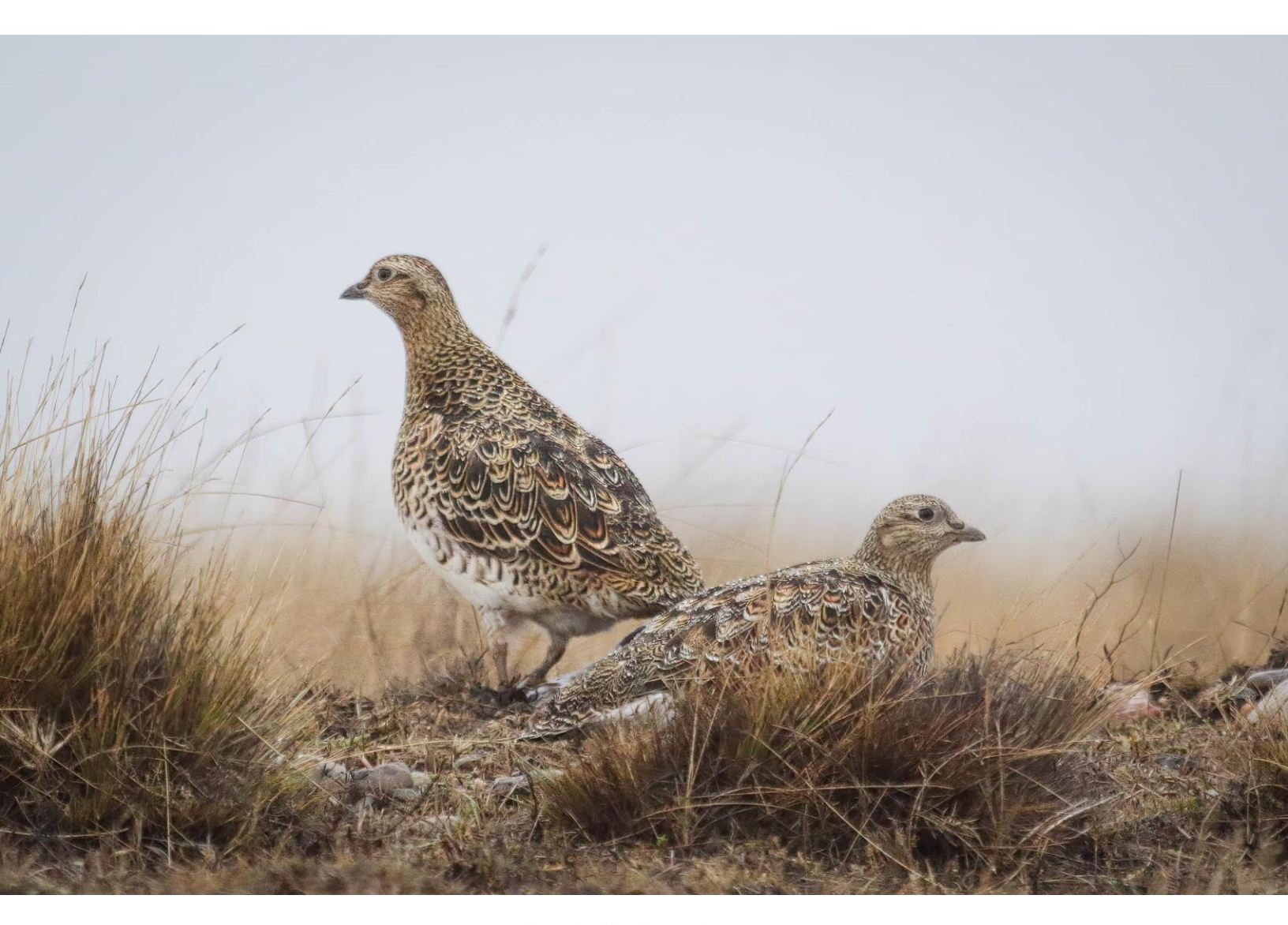
White-bellied Seedsnipe | Agachona Patagónica | Attagis malouinus